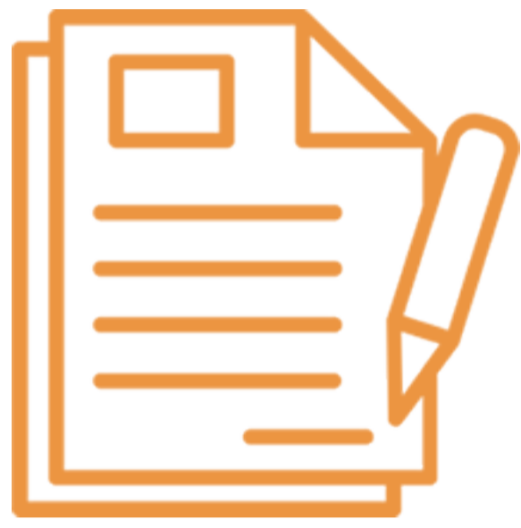
Ease of doing business

For traders to do business in India, ease in redundant procedures and regulatory processes is of paramount importance. DIGIT-Trade License increases procedural efficiency and improves the accessibility and transparency of information thus enabling business to flourish and function with ease.