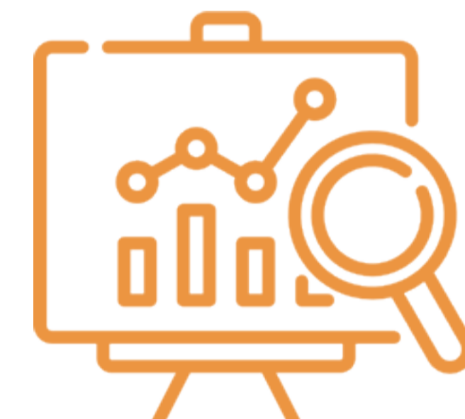
Data-driven decision making